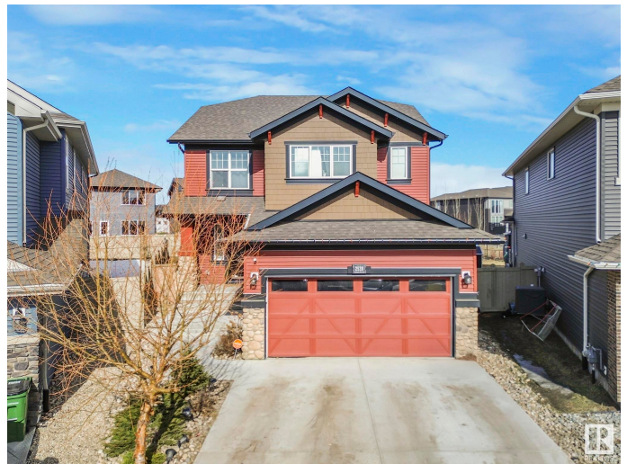
2539 Orchards Way SW, Edmonton, AB

MLS® # E4427515 Price $850,000 Bedrooms 6